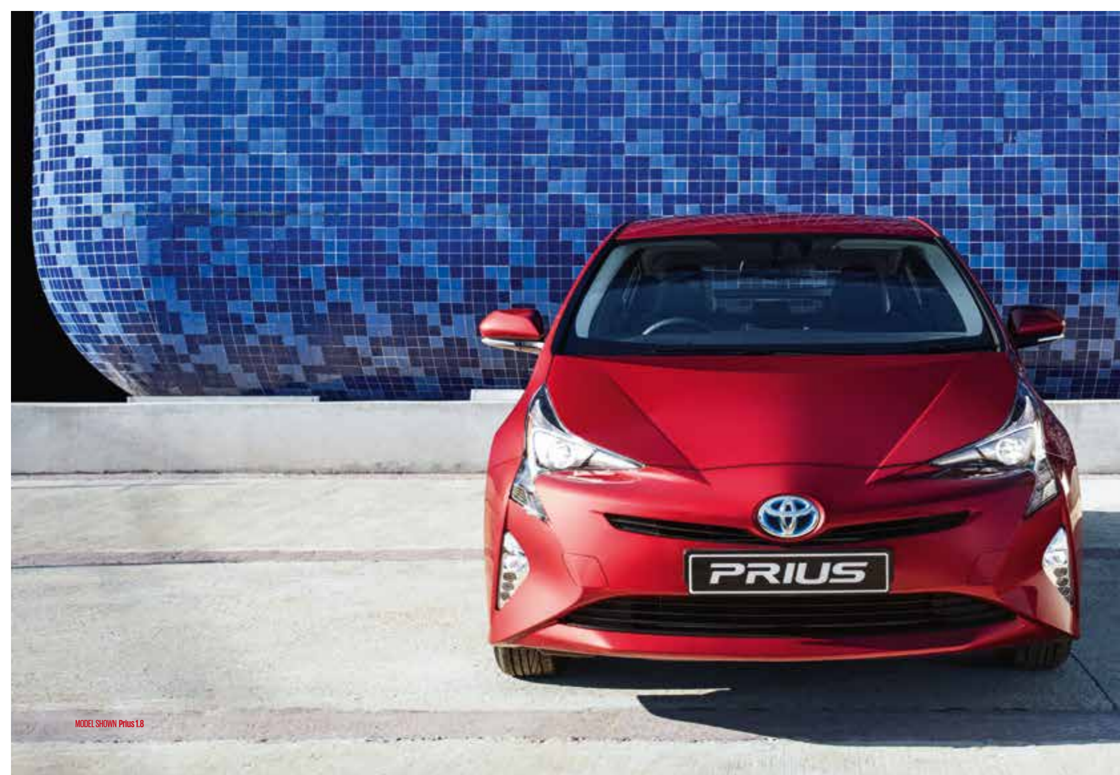
MODEL SHOWN Prius 1.8