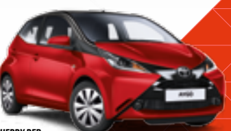
AYGO X-PLAY BLACK ROOF 3PO CHERRY RED