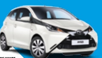
AYGO 068 ICE WHITE