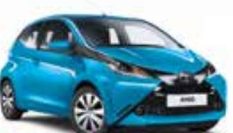
AYGO 8W9 CARIBBEAN BLUE