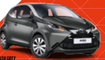
AYGO X-PLAY SILVER ROOF 1E0 ASH GREY