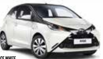
AYGO X-PLAY BLACK ROOF 068 ICE WHITE