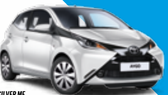
AYGO 1E7 QUICKSILVER ME