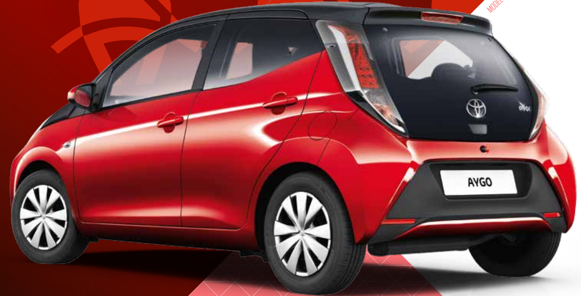
MODEL SHOWN AYGO X-PLAY

ABS, Brake Assist, driver, passenger and side airbags. Hands free Bluetooth and audio integration.