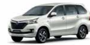
Tusk White W09