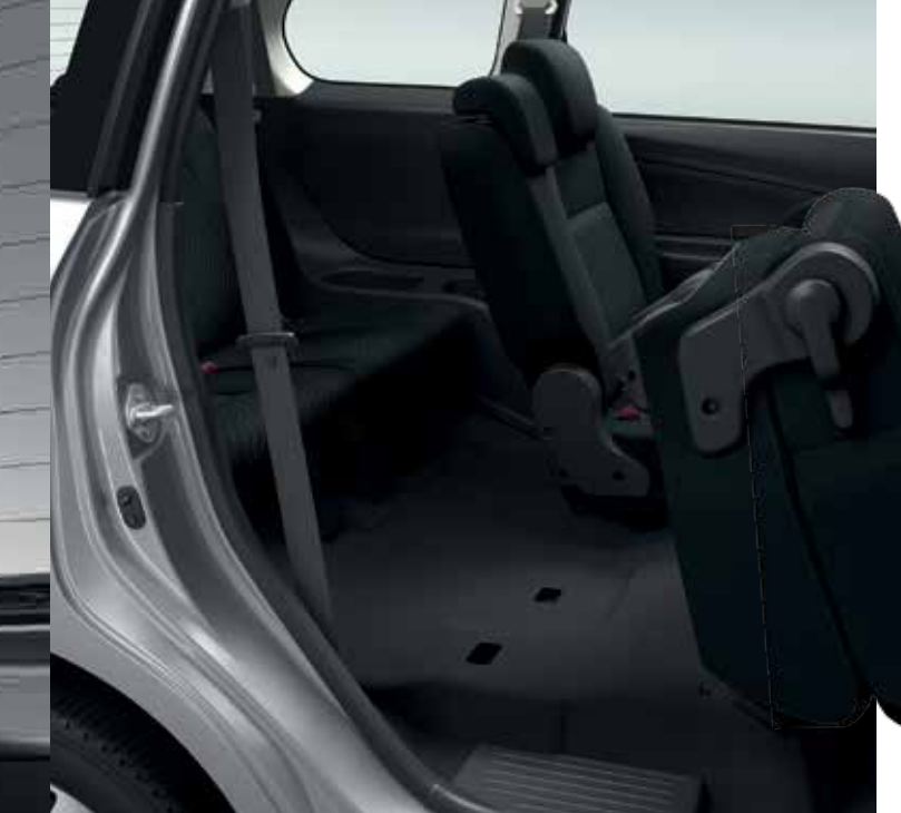
Second row seats split forward for easy access to the rear, while the third row split-seat, cushion-tumble feature enables expansion of the luggage space.