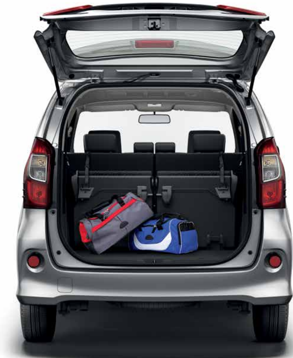
The Avanza's seats easily reconfigure to suit your specific needs, with three rows of seats that have ample legroom for all passengers.