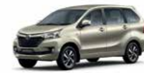
Gold Leaf Metallic T23