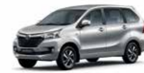
Quicksilver Metallic 1E7