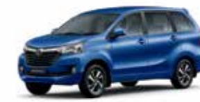
Cosmic Blue 8X2