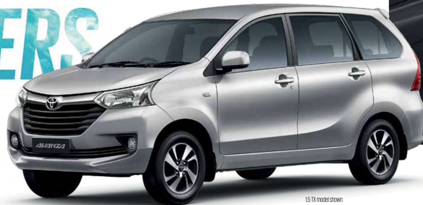
1.5 TX model shown

Running families and businesses requires plenty of time on the road, running between points A and B and sometimes to what seems like point Z. The Avanza was specifically designed to take everyone's safety into account.