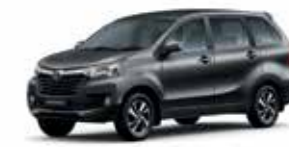
Graphite Grey Metallic 1G3