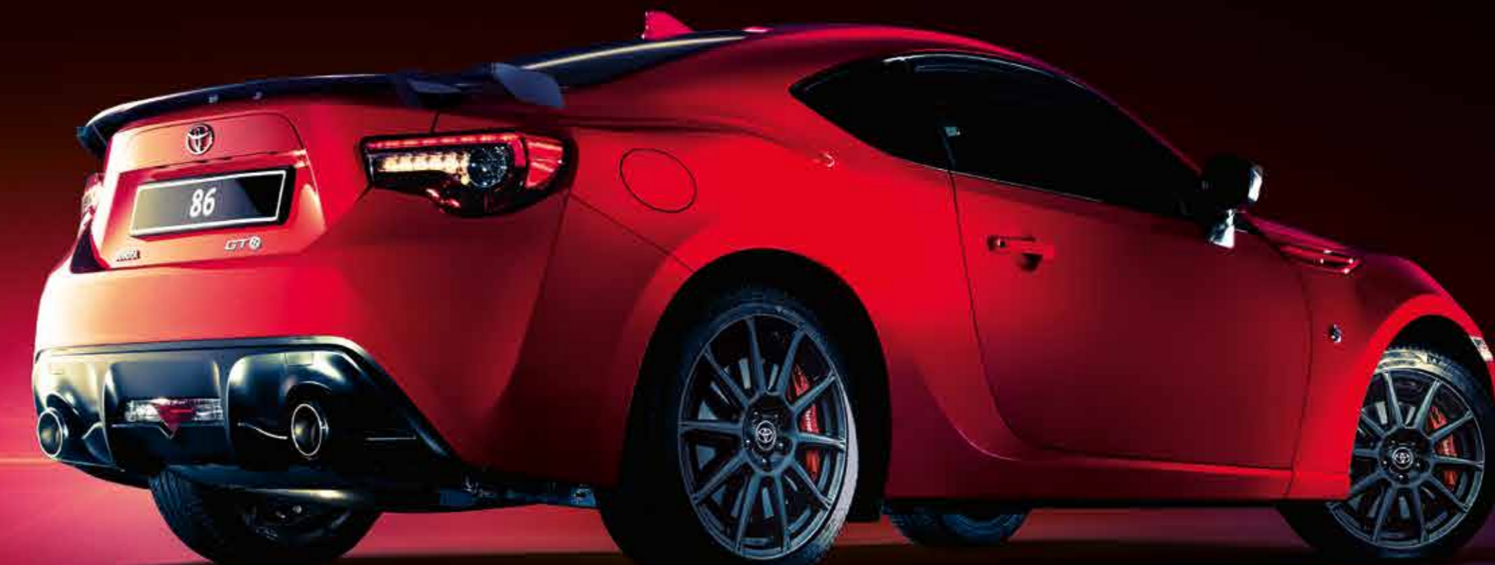
MODEL SHOWN GT86