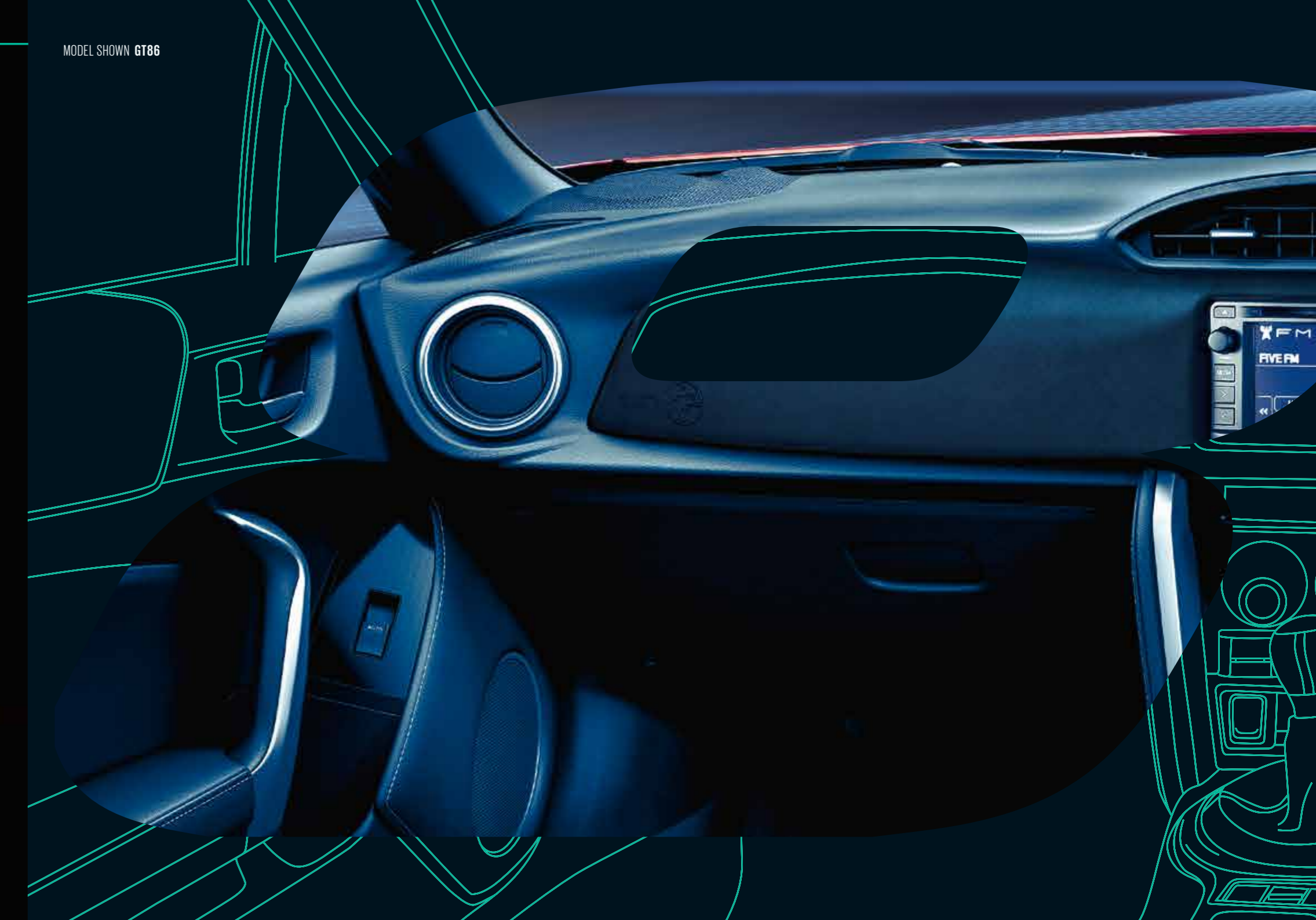
MODEL SHOWN GT86