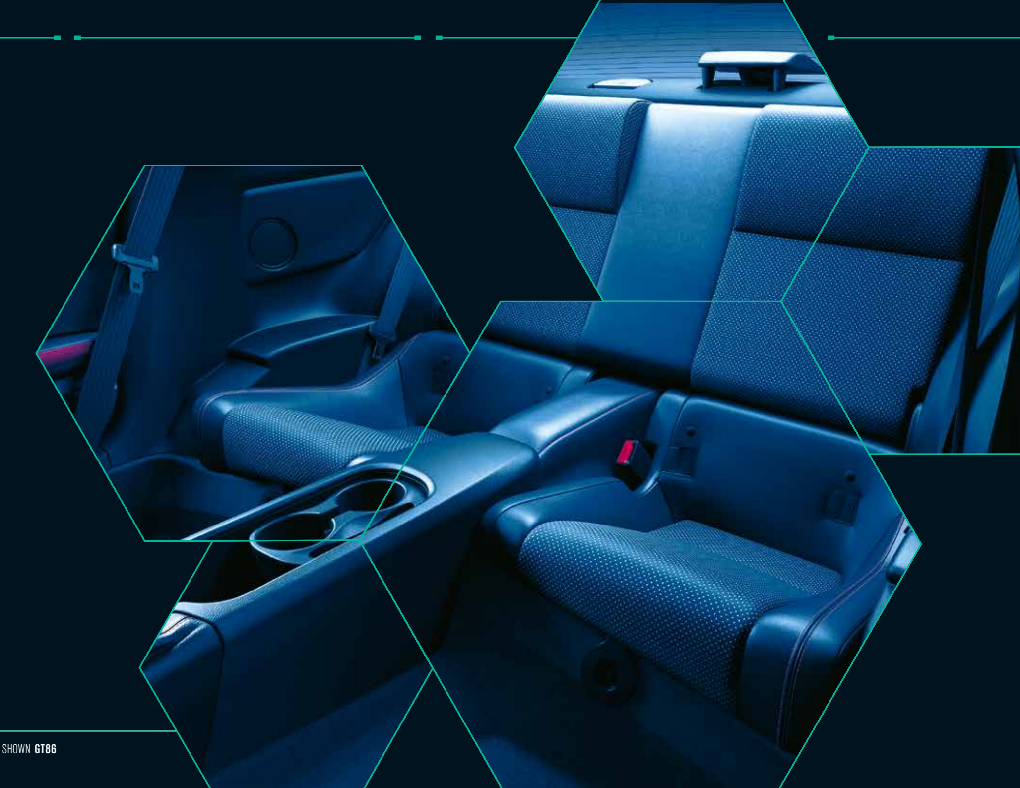
MODEL SHOWN GT86