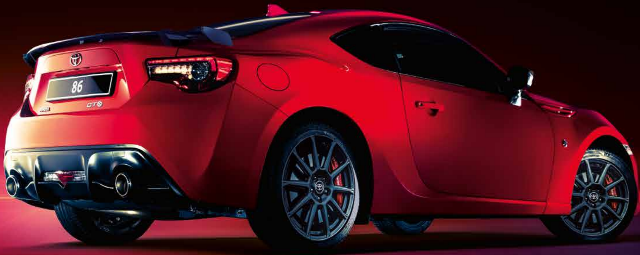
MODEL SHOWN GT86