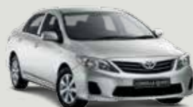
1F7 Satin Silver Metallic