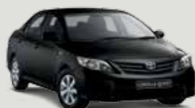
209 Eclipse Black Metallic