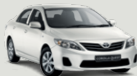
040 Glacier White