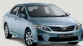
8N0 Seaside Pearl Metallic